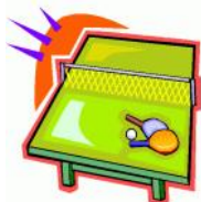
Table Tennis Tournament

The SMCS Table Tennis Tournament is under way! Students in grades 3, 4, 5 and 6 are vying for the championship. One overall champion will be declared as well as one for each grade level. Come see the action on Mondays, Wednesdays and Fridays during lunchtime in the cafeteria!