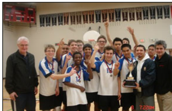
The team celebrates the first place finish at the